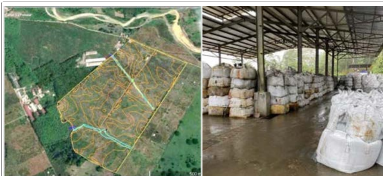
Figure 2: Aerial view of the Tenguel site and bags of material for processing

In October 2024, Silver Crown Royalties entered a definitive purchase agreement to acquire the BacTech royalty. 90% cash equivalent of the silver processed at BacTech's Tenguel bioleaching facility in Ecuador is due under the royalty. It guarantees a minimum payment of 35,000 ounces annually for at least ten years following the start of regular processing operations. The purchase price was $4.0 million and was paid for with 400,000 Silver Crown Royalties shares at a deemed value of $10.0 per share (shares closed at $8.25 on the day of the announcement) and an equivalent number of 36-month warrants with an exercise price of $16.0. The shares are paid out in tranches, consistent with management's approach of prudent risk management, once certain milestones are achieved. 100,000 shares are issued upon grant of the royalty, 100,000 are issued when the project is successfully financed, and 200,000 are issued when commercial production is achieved. Aside from being a potentially lucrative deal, this investment also supports an environmentally friendly approach to gold extraction, which is a positive attribute from an ESG perspective. The transaction with BacTech was closed towards the end of November 2024 and helped it strengthen its balance sheet.